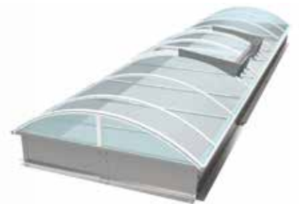
ARCH SHAPED ROOFLIGHT with smoke exhaust vent and deflectors