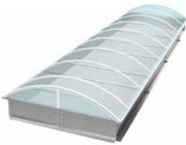
ARCH SHAPED ROOFLIGHT