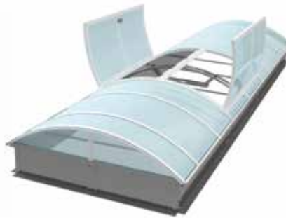
ARCH SHAPED ROOFLIGHT with smoke exhaust vent